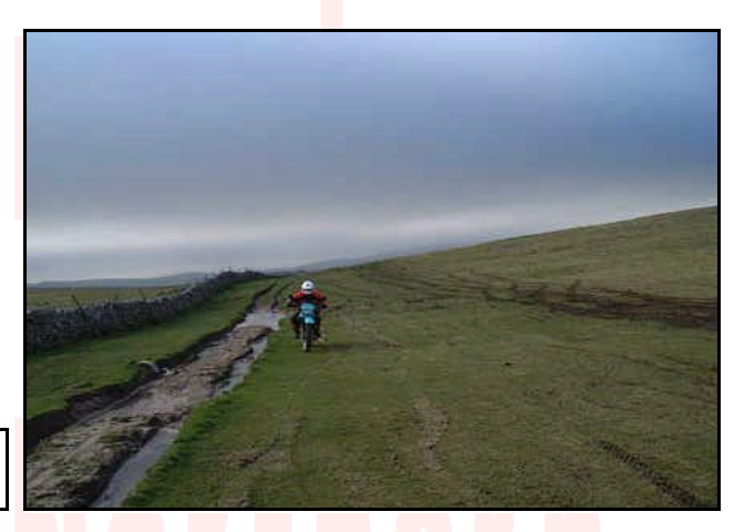
Photo: Mastilles lane - it is in poor condition, but if you must drive it keep near the original track

Hmm, Edmund Hirst .. how many times has he been in the Daleman's letters page, well despite his romantic wallowing I'm afraid Mr Hirst is just trying to put the frighteners up the public. Firstly 4x4's cannot physically use this lane due to two 4 foot gateways, secondly on the occasions I've used this lane I've never seen another 4x4 or trailbike, infact it is so little used that in most places it is very difficult to follow the track on the ground - it is just green grass!